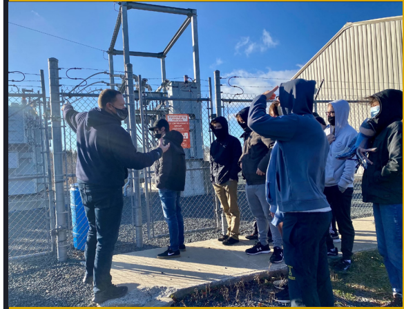
Science 10 class from James M. Hill visiting the Lameque Wind Farm with the Centre of Excellence for Energy.

Register at https://realworldchallenges.ca