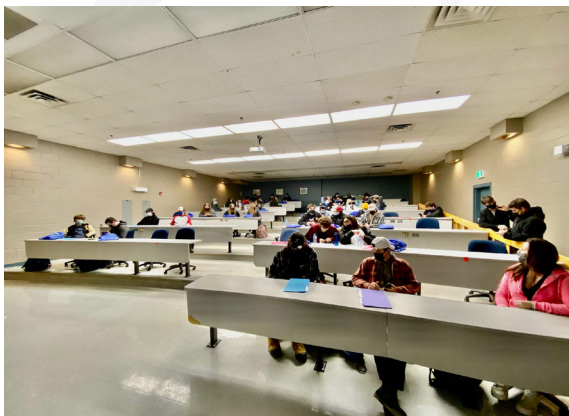
The ICE Centre in Miramichi and The IDEA Centres in Moncton and Saint John were excited to welcome new classes of students to engage in experiential learning at its finest. Students pictured here are settling in on their first day of opportunities to work with industry partners and gain career experience.

The COE model is designed with collaboration in mind. In the coming months, we hope to visit as many schools as possible (virtually or in-person) to discuss the Centres of Excellence model, the learning supports provided, and hear directly from you (the experts) what kinds of opportunities will meet the needs of your students. Please contact coe@gnb.ca to arrange a short presentation at your next staff or team meeting – we'd love to connect with you.