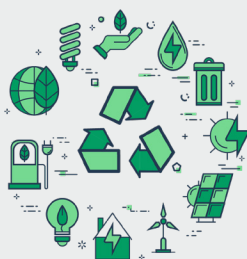
Elementary (k-5) Resources

The Gaia Project offers easy access to climate change education as your students return to the classroom. And it's all FREE! Visit The Gaia Project and select your grade level on the "Teachers" drop down menu to see featured programs and resources!