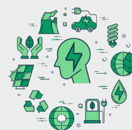
High School (9-12) Resources