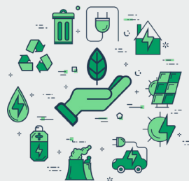
Middle School (6-8) Resources