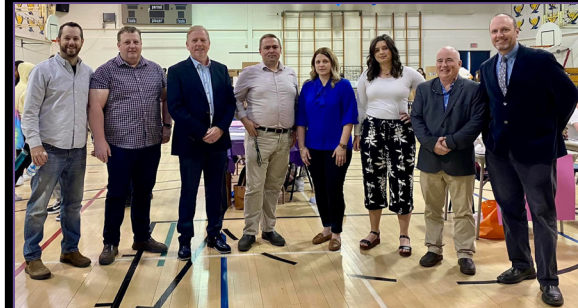
Partners of COE Entrepreneurship volunteered time to serve as judges for a face-to-face Youth Entrepreneur Showcase Market and regional Pitch Contest at Blackville School on May 19th.