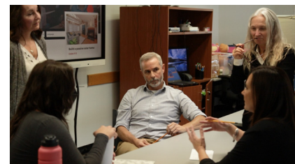
District subject coordinators and leads in ASD-N collaborate with Centres of Excellence leads

This month, the COE team hit the road to collaborate with curriculum teams in ASD-S and ASD-N. After a brief presentation, COE leads met with subject coordinators and district leads/coaches to explore opportunities for collaboration. This time has allowed us to continue the work of creating a shared vision for Centres of Excellence learning supports for K-12 classrooms. Thank you for sharing your collective wisdom and passion with us!